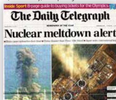
The Daily Telegraph

I was also impressed by the journalists who interviewed us and asked insightful questions as they got to grips with the science involved. It