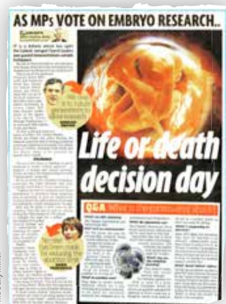
The Daily Mirror