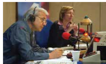
BBC Radio 4, Today programme.

This was followed swiftly by complaints to the National Research Ethics Service and the General Medical Council. The complaints again looked identical, were based on defamatory allegations and were clearly part of a co-ordinated attack. The allegations of affairs, money making and conspiracy made my life seem much more interesting than it really was (or is). The Bristol University authorities were shocked but supportive. The allegations made my husband laugh.