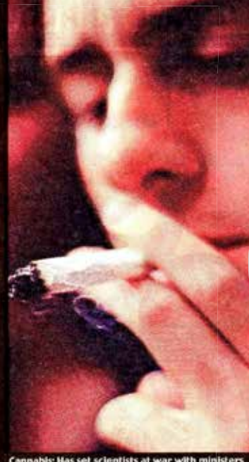
Cannabis: Has set scientists at war with ministers